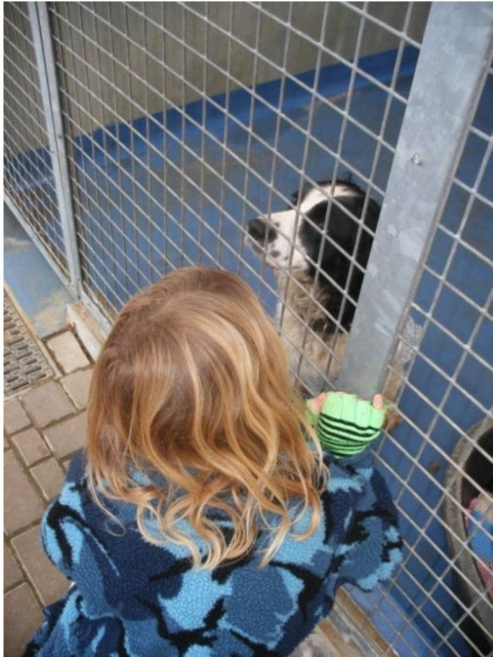
Sarah with a homeless dog at Wood Green Animal Shelter